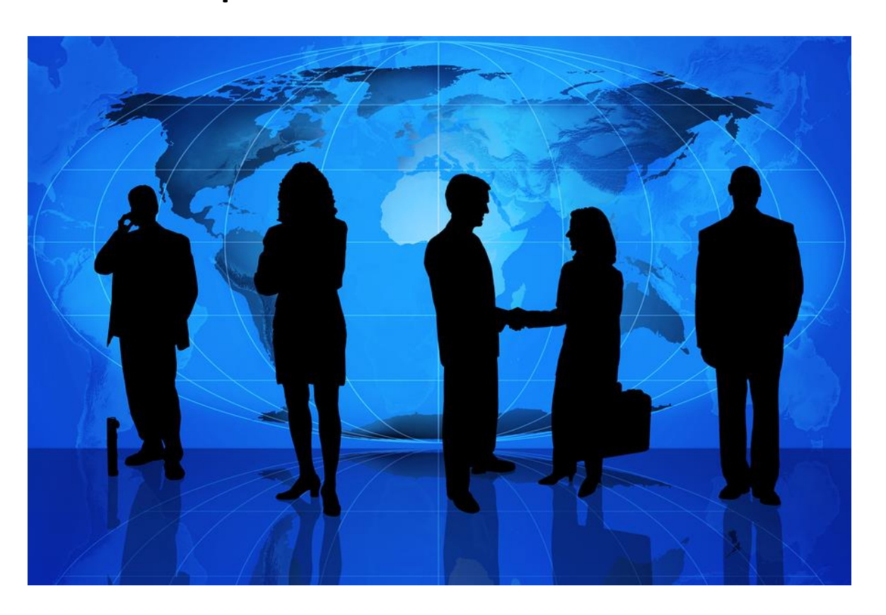
BFU: Capitalism and Investment